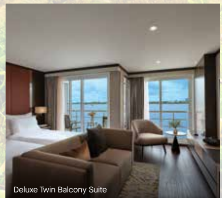
Deluxe Twin Balcony Suite